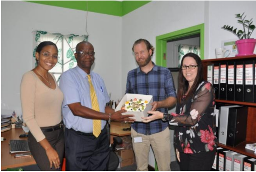
The President of the SEF thanking Satel N.V. for sponsoring the SCS with school materials