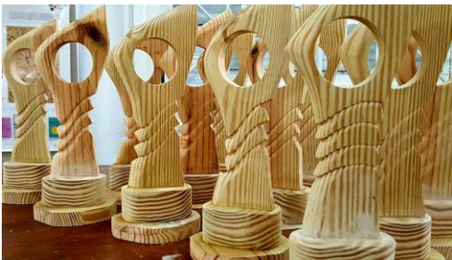
The Visual Arts Department assists the Triathlon Foundation with the trophies