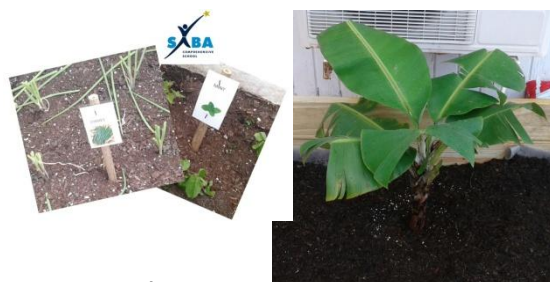
Pictures above show items from the agriculture 'Grow your own in the school' project.

Examples of Clubs are: Sail Club, Spanish Club, Cooking Club, Archeology Club, Hiking Club, Leo Club, Drama/Music club, Debate club, Chinese Club, Robotics Club, Tech Club, Life Skills Club, Agriculture Club, Teen Times Club, and Sport Club.