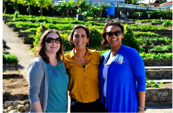
Collaboration with ROA CN is important for the vocational students and labor market.