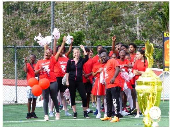
Red House winner of Sports Day 2018