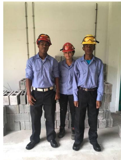
The vocational Tech students with their new uniform.